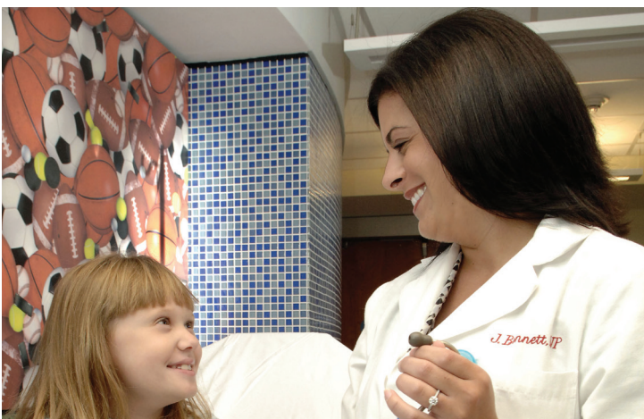
Family, Adult/Geriatric and Psychiatric Nurse Practitioners are encouraged to apply.